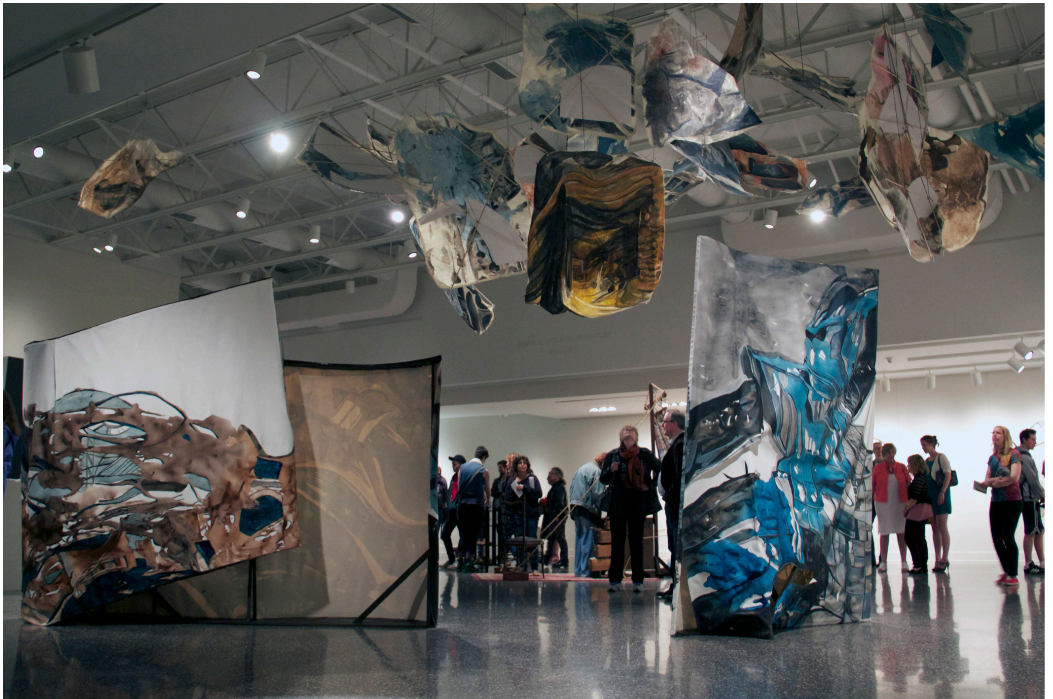
Points of Departure , installation at the State University of New York, New Paltz; 2014