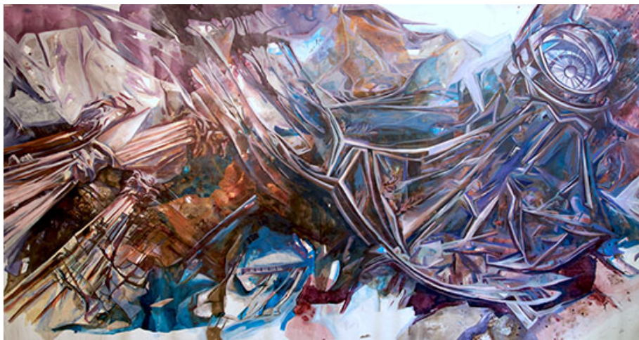
"Melody of the Oculus, Federal Hall" by Zahra Nazari, 2017. Acrylic on Canvas, 80 x 150 x 24 inches.

435 Broome Street (between Broadway and Crosby), New York, NY 10013. www.4heads.org/portal-2016 ( http://www.4heads.org/portal-2016/ ).