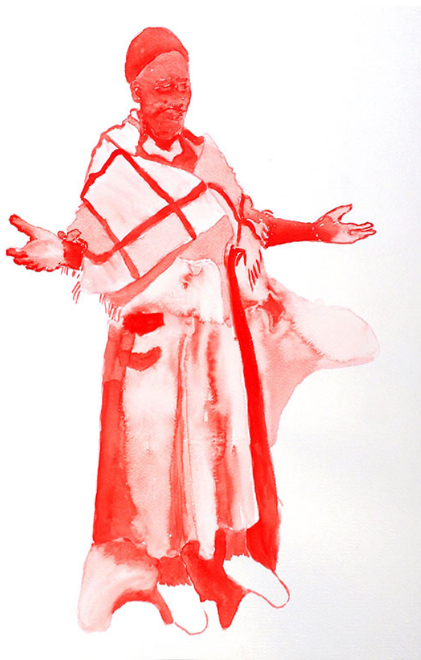
"Waiting for Gebane" by Senzeni Marasela, 2016. Watercolour, 24 x 17 inches. Exhibited with Afromova Gallery at 1:54 Contemporary African Art Fair.

Pioneer Works, 159 Pioneer Street, Brooklyn, NY 11231. www.1-54.com ( http://1-54.com/ ).