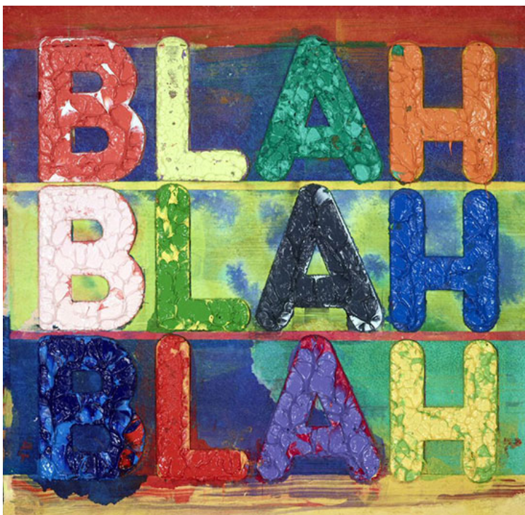
"Blah Blah Blah" by Mel Bochner, 2016. Monoprint with collage, engraving and embossment on hand-dyed Twinrocker handmade paper, 38.1 x 38.7 cm. Exhibited with Sims Reed Gallery at Art New York.

Pier 94, located at 12th Avenue at 55th Street, New York, NY 10019. www.artnyfair.com ( http://www.artnyfair.com ).