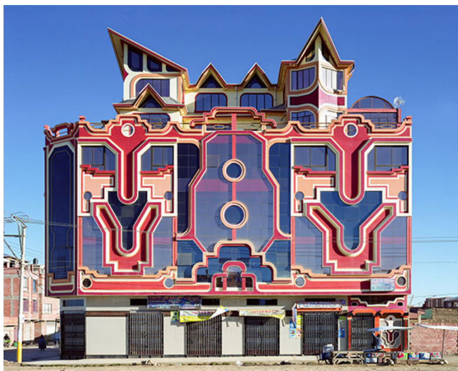
"Neo-Andina #031" by Tatewaki Nio, 2015. Inkjet print on cotton paper, 32 x 40 inches. Exhibited with Sergott Contemporary Art at CONTEXT New York.

Pier 94, 12th Avenue at 55th Street, New York, NY 10019. www.contextnyfair.com ( http://www.contextnyfair.com/ ).