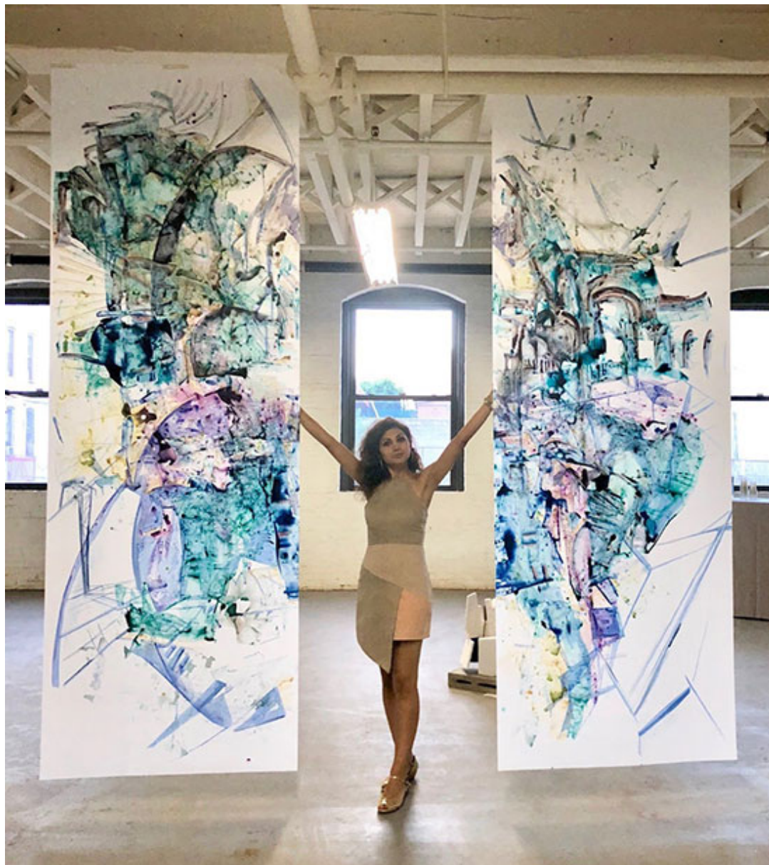
"Dream Palace" by Zahra Nazari, 2018. Acrylic on mylar, 120 x 84 inches.

Damien Anger, my piece, "Skylight" was selected for its playfulness of color. There is an abstraction of an oculus delivering colors that transition from top to bottom. The layers go from pink to ochre, green, blue and dark blue.