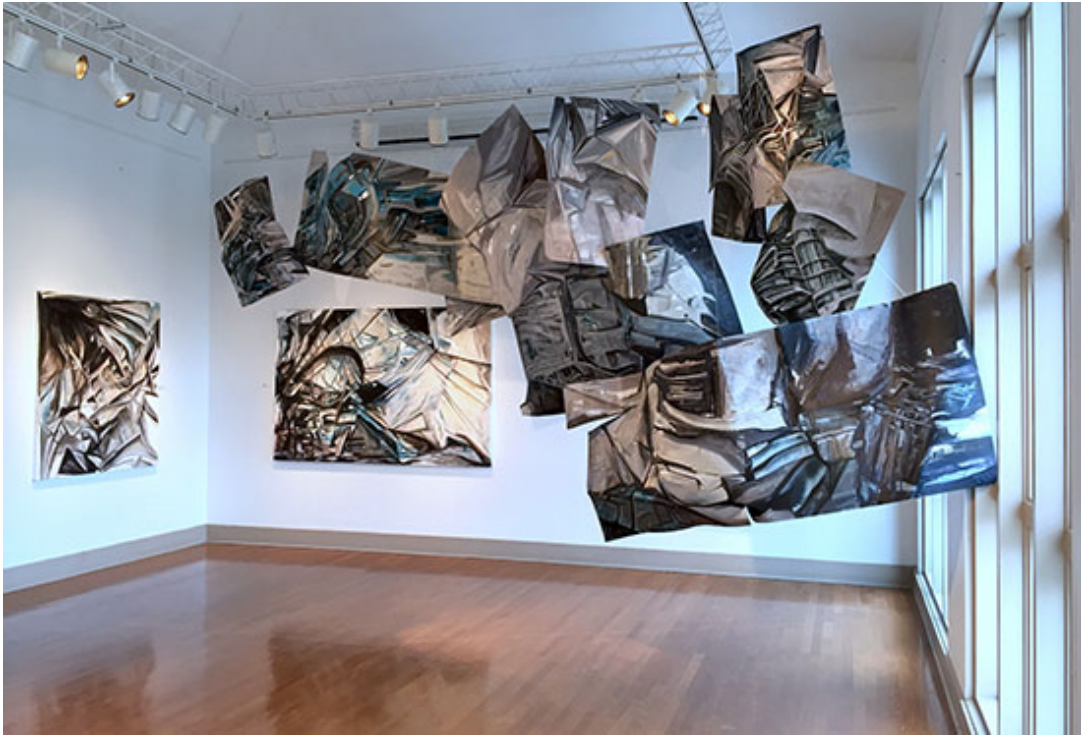
“Transformations” by Zahra Nazari, 2016. Acrylic on shaped industrial grade aluminum sheets and canvas, 96 x 228 x 120 inches, site-specific installation, Main Line Art Center, PA.