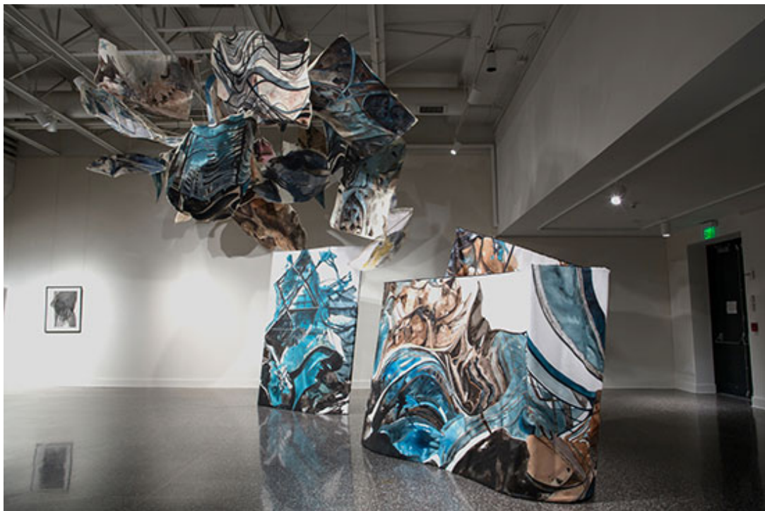
“Points of Departure” Installation by Zahra Nazari, 2014. 29 architonic kite forms and 2 shaped freestanding canvas structures, Acrylic and ink on canvas and asian paper.

Inspired by the juxtaposition of ancient ruins alongside ultramodern infrastructure in her native city, Nazari's abstraction is influenced by architecture. Hints of familiar imagery like arches, columns and building facades are distorted into surreal forms roiling across the picture plane. Typically muted palettes are sometimes interrupted by a burst of bold color, and a subtle luminosity keeps her work just shy of Brutalist.