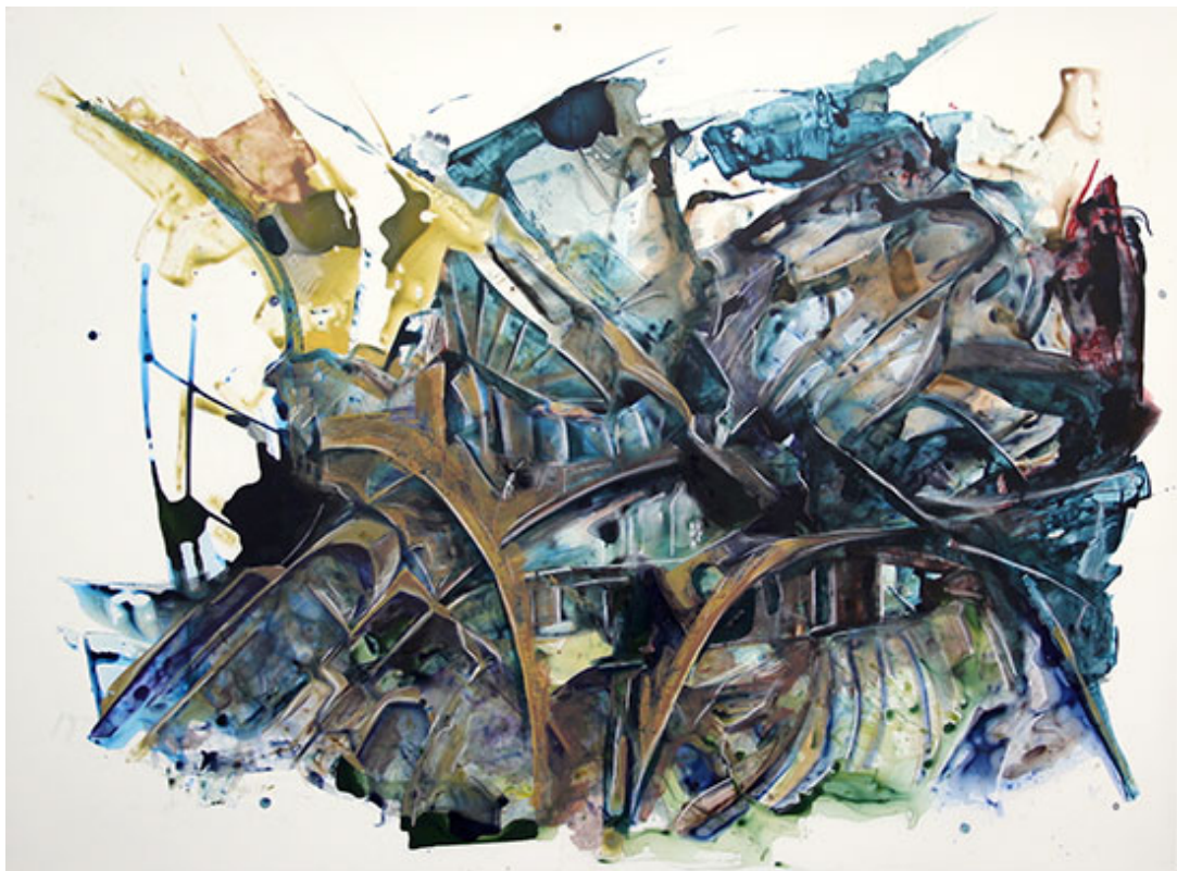
"Transpose" by Zahra Nazari, 2018. Acrylic, link on mylar, 42 x 56 inches. Courtesy of the artist.

This summer, Nazari's work was featured in the inaugural exhibition of the new Long Island City arts space, Cigar Factory , and can be seen at the Carrie Able Gallery in Brooklyn through July 28, 2018. A recent discussion touched on her art practice and what viewers can look for from this promising emerging artist going forward.